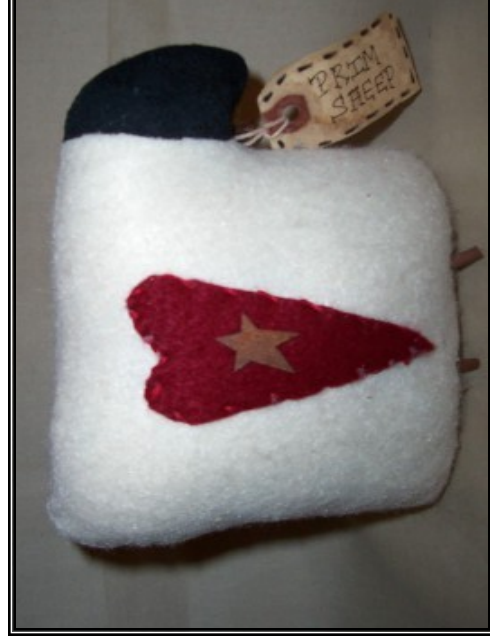
Primitive Sheep approx. size- 6" TPH-#102